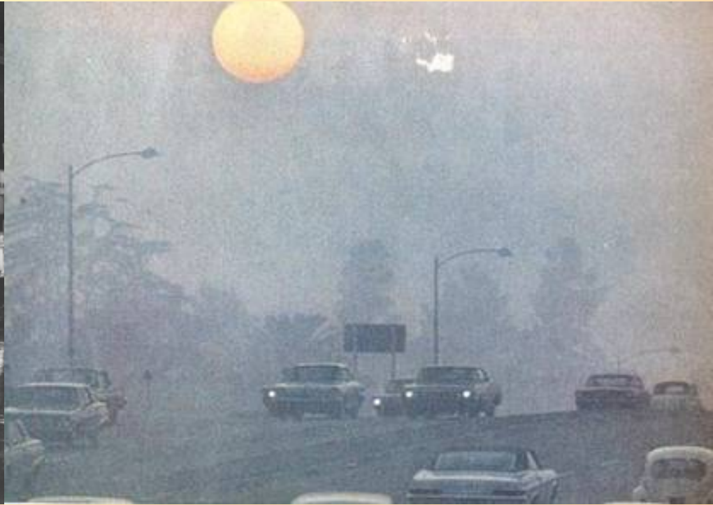
Afternoon in Los Angeles, early 1960s