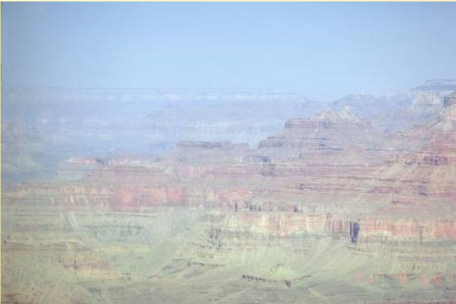
Grand Canyon, 6/21/1985, 9 AM