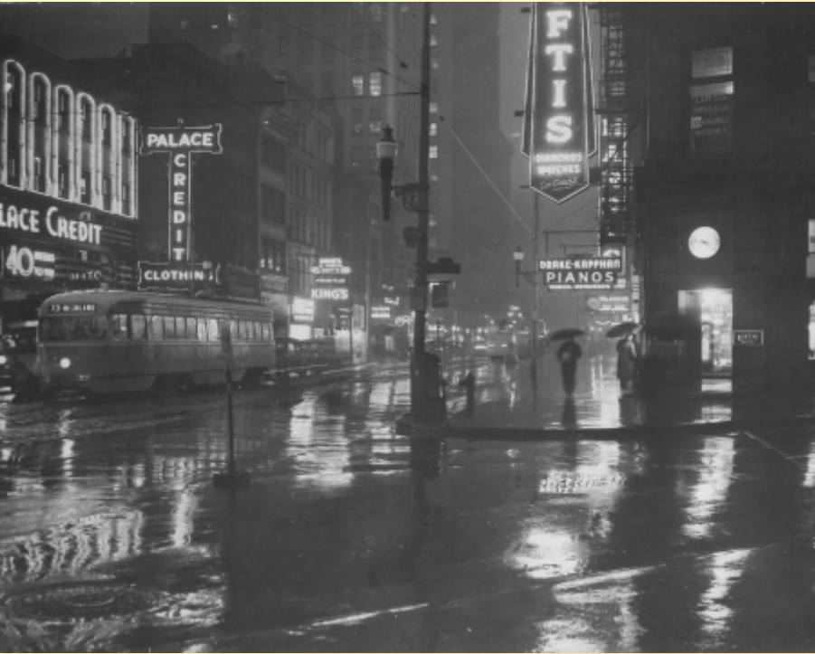
9:20am in downtown Pittsburgh, 1946