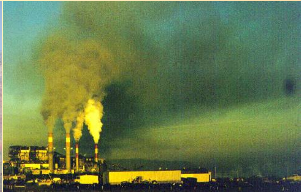
Four Corners coal-fired power station, east of Grand Canyon, 1970s